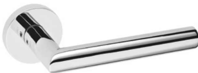
IN.00.030.P Polido / Polished / Pulido