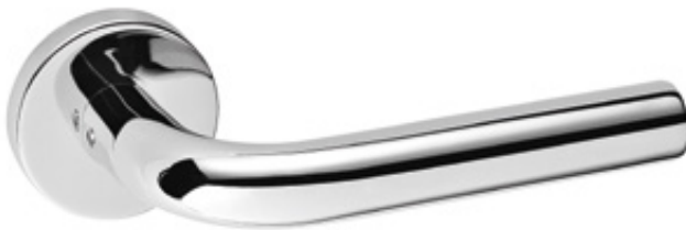
IN.00.028.P Polido / Polished / Pulido