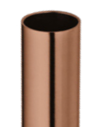
pvd titanium copper