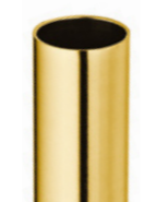
pvd titanium gold