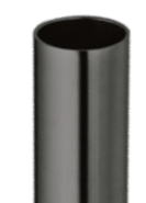
pvd titanium black