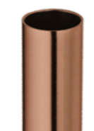
pvd titanium copper