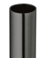
pvd titanium black