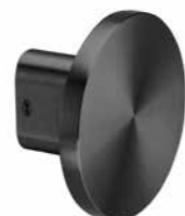
IN.00.165.D.TB Titanium Black