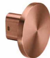
IN.00.165.D.TCO Titanium Copper