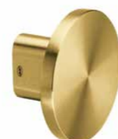
IN.00.165.D.TG Titanium Gold