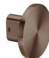
IN.00.165.D.TCH Titanium Chocolate